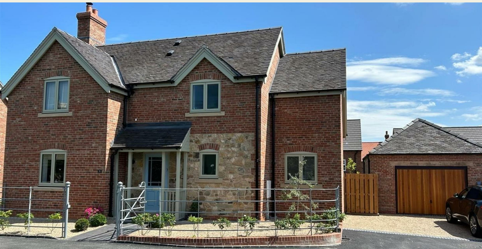
Image Of House Built Elsewhere